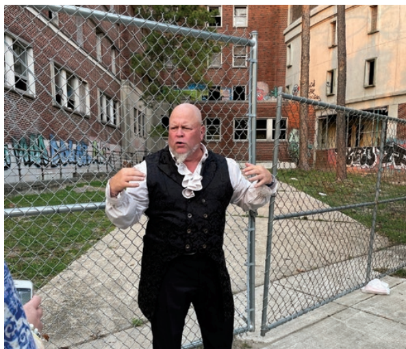
The tour guide for the haunted ghost tour dressed the part

Among the classroom learning and the celebration of new designees, there was also time for venturing out and experiencing all that New Orleans has to offer. On Wednesday evening of the conference, there was a group dinner at Emeril's in the Warehouse District.