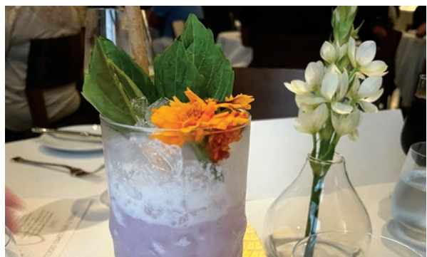
One of the beautiful cocktails served at Emeril's