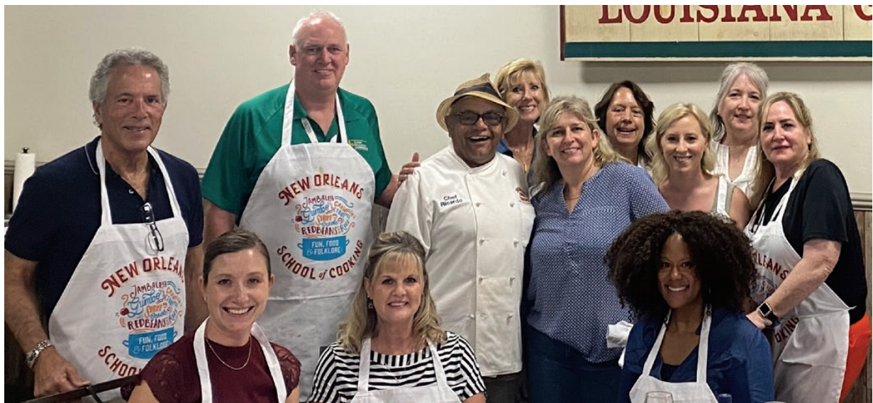
Participants enjoyed cooking a New Orleans style meal at the New Orleans School of Cooking